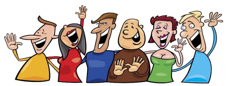
Smile for the Day